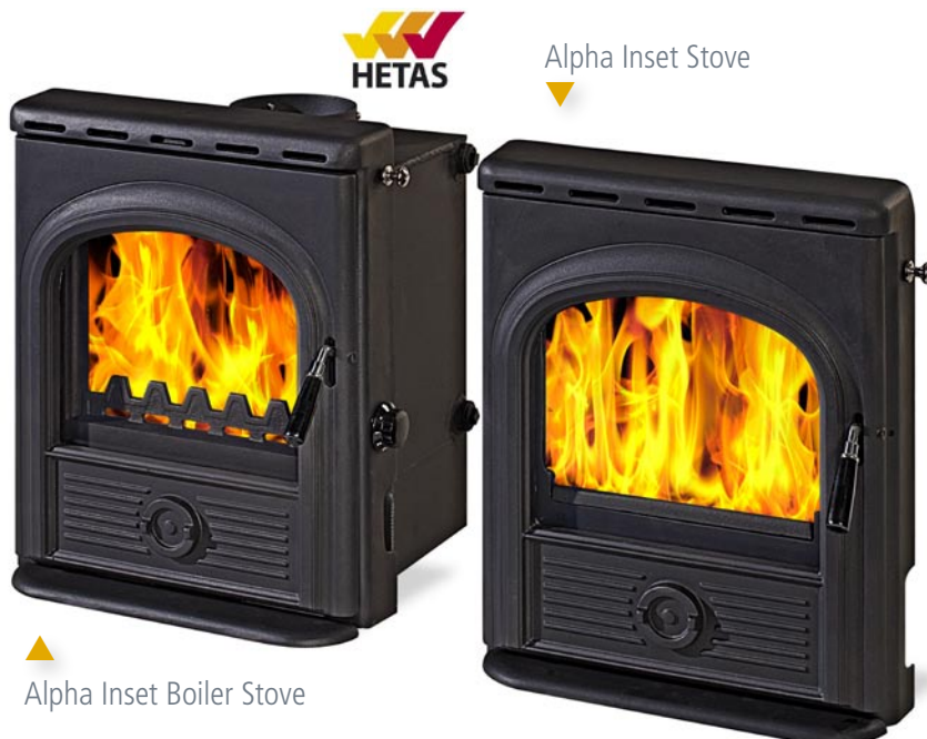
Alpha Inset Boiler Stove

UK designed and CE tested, the precision engineered and robot-welded steel bodywork, superior F-type detailed castings and premium quality components (from companies such as Forest Paint of USA and Schott Glass of Germany) ensure that Alpha insets and inset boiler stoves will not only exceed the expectations of today's discerning stove owner but will also continue to provide pleasurable heat throughout the home for many years to come. Each inset boiler is individually pressure tested – twice, prior to being fitted to the stove and is also covered under Alpha's 5 Year Guarantee.