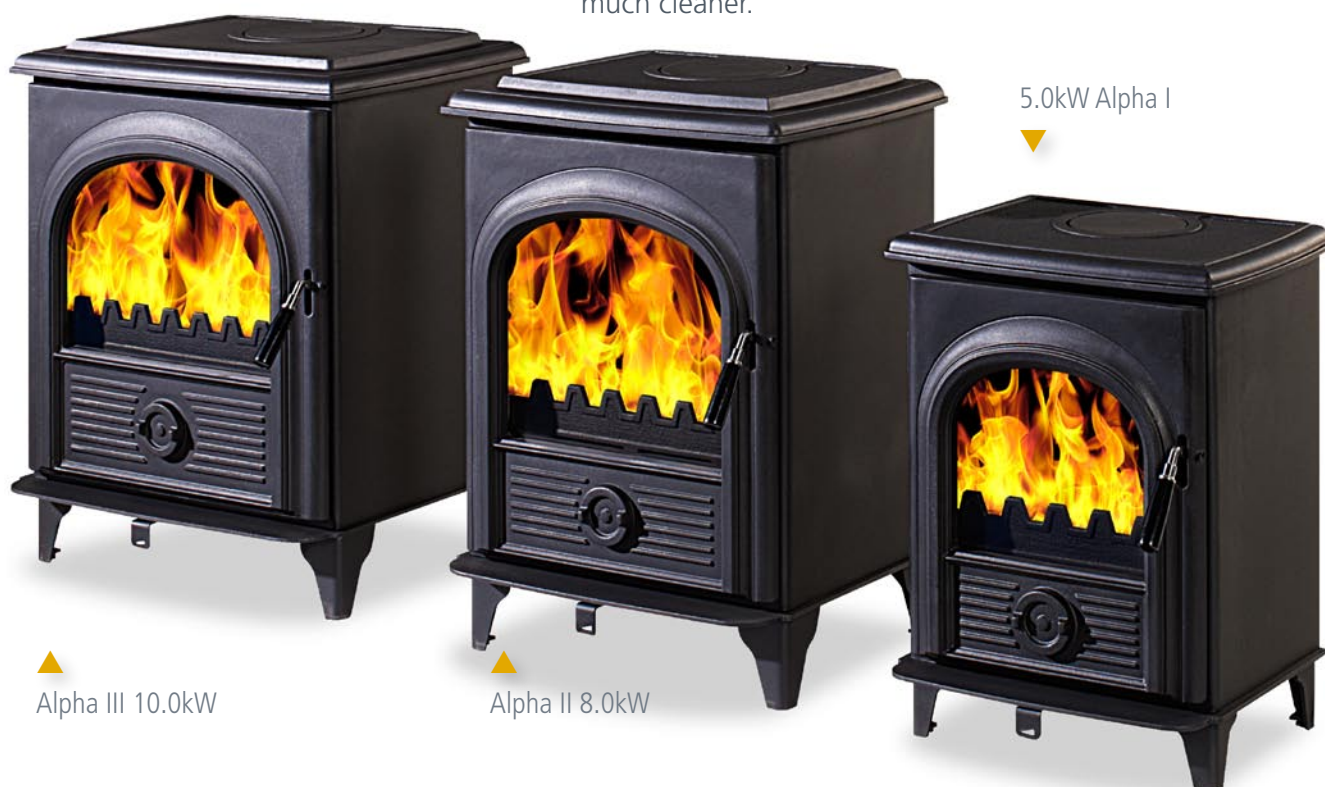
Alpha III 10.0kW