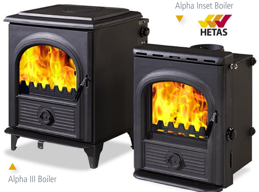
Alpha III Boiler

12.1kW* mineral fuels / 15.1kW wood logs